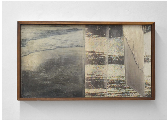
Katie Sinnott Light/wave , 2015 photographic print and acrylic on wood relief 14 x 25 x 3 inches