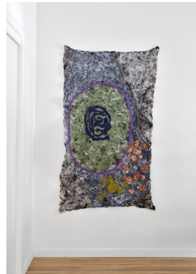
Pauline Shaw oo , 2019 felted wool with silk, bamboo, ingeo, and milk fibers 66 x 37 inches