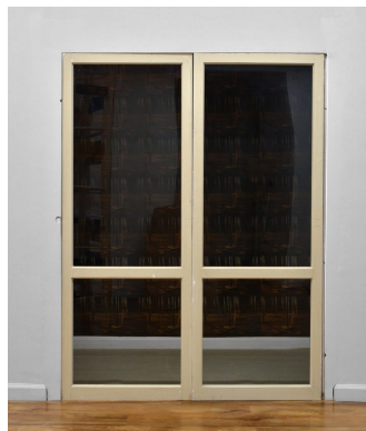
Alice Jacobs Window with a view , 2019 photographic print, glass doors, carpet, wallpaper steamer dimensions variable