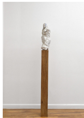
Jack C. Baker Venus , 2017 ceramic debris, clay, resin, wood 63 x 8 x 6 inches