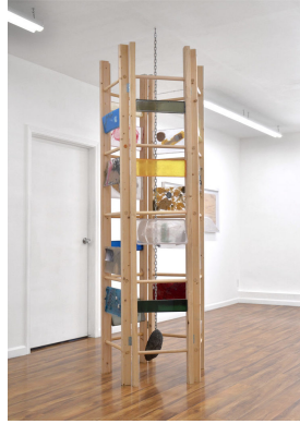
Jack C. Baker Framework , 2018 mixed media Variable