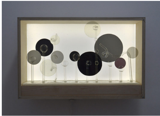
Pauline Shaw field I , 2019 handblown borosilicate glass set in wax within wooden light- box and polarizing film 19.5 x 12.5 x 7.5 inches