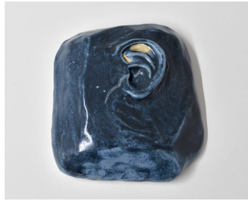
Bennet Schlesinger Ocean equilibrium , 2019 ceramic, glaze 6.5 x 6 x 2 inches